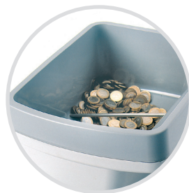
Large coin hopper (SC 360)

SCAN COIN AB headquarters: T +46 (0)40 600 06 00, info@scancoin.com Go to www.scancoin.com for more information