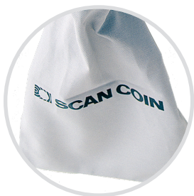
Bag holder for rejected coins